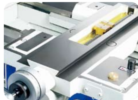
Reservoir Oil Bath Type Cross Slide (S series)